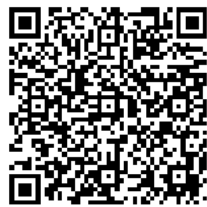
Pride March Sign-Up