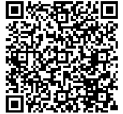
Pizza & Pride RSVP

From My Gay Grandparents." To help us plan for food, please RSVP using the QR code. We hope this will be an evening of community, storytelling, creativity, and joy as we celebrate Pride together